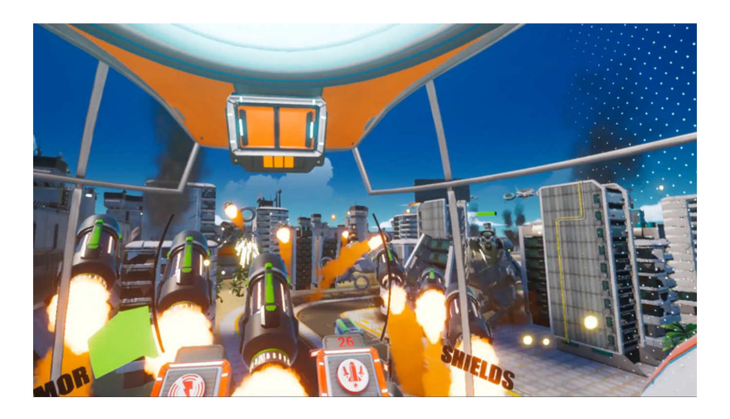
The IOTA Project Crack Google Drive

Download ->>->> <a href="http://bit.ly/2JmIeF3">http://bit.ly/2JmIeF3</a>